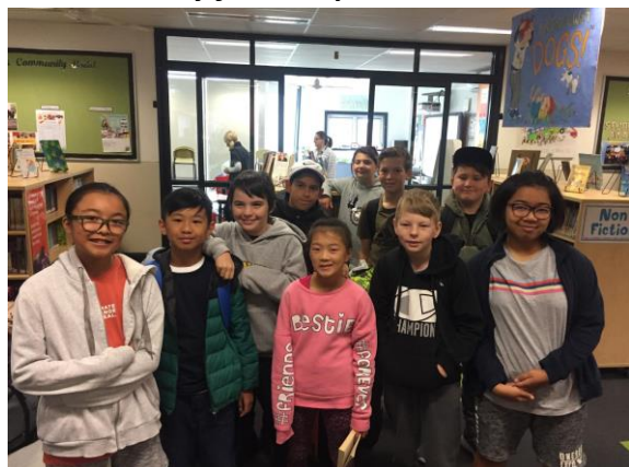
Day One .....

It was a really fun camp! Senior B consensus.