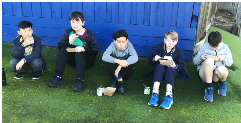
Footy Day Lunch