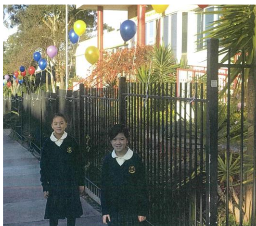
Welcome back Yrs 3-6